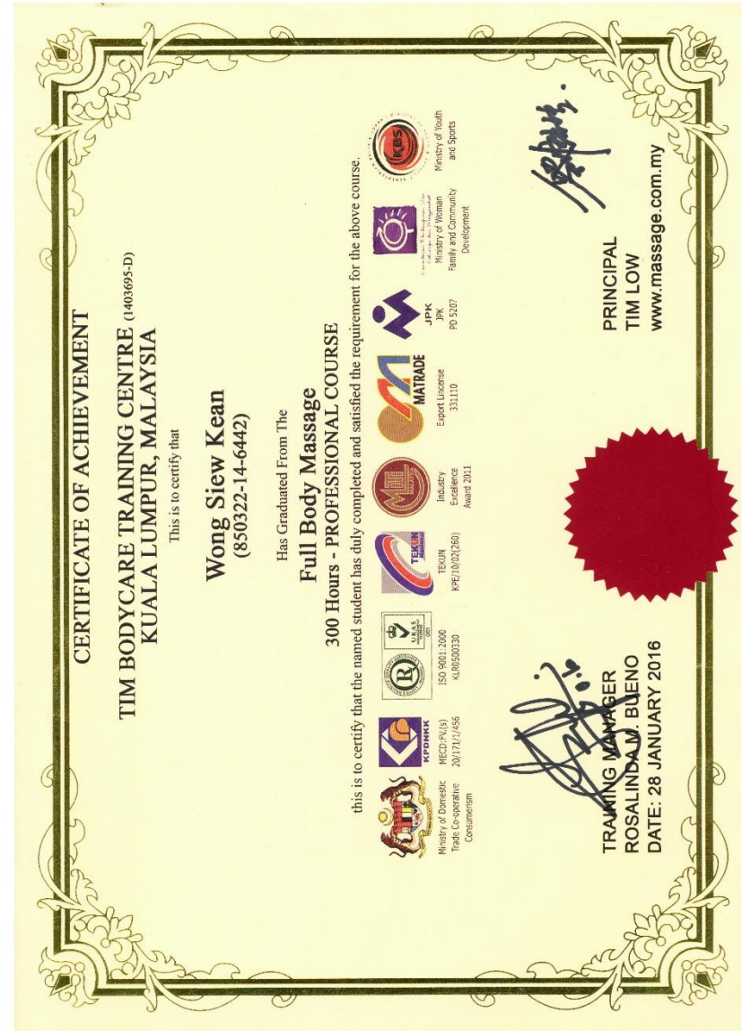
Example of our course certificate